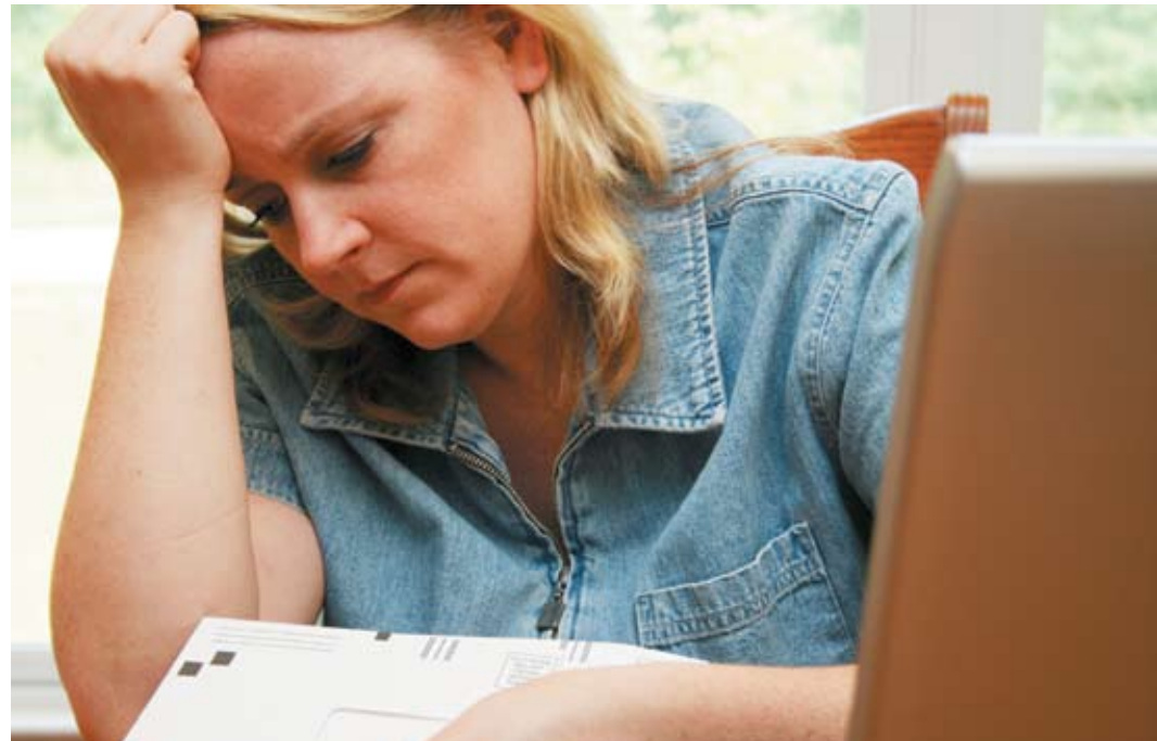
A helpful resource for patients in need of financial assistance

460 Andes Road Delhi, NY 13753 (607) 746-0300 www.oconnorhosp.org